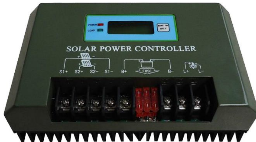
JN Solar Charge Controller 50A